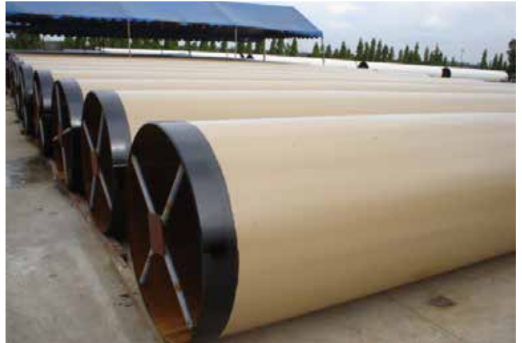
Belzona 5811 used for buried pipe protection

Belzona 5811DW2 is WRAS approved for potable water contact.