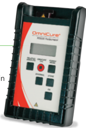
Optional Accessory: OmniCure R2000 Radiometer

Radiometry is an essential link for measuring the light output from a UV curing system in order to maintain a repeatable process. The OmniCure R2000 UV Radiometer can be combined with the OmniCure S2000 UV curing system to provide a complete curing station with unmatched control and repeatability.